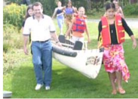
Launching into the deep at Family Fun Day