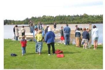
A perfect afternoon for our Family Fun Day at Murray's Pond.

The estimated date of delivery for our anniversary yearbook will be mid-late October.